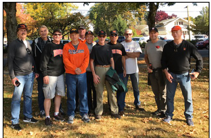
Pledge Class of 1973 Together at Homecoming 2018