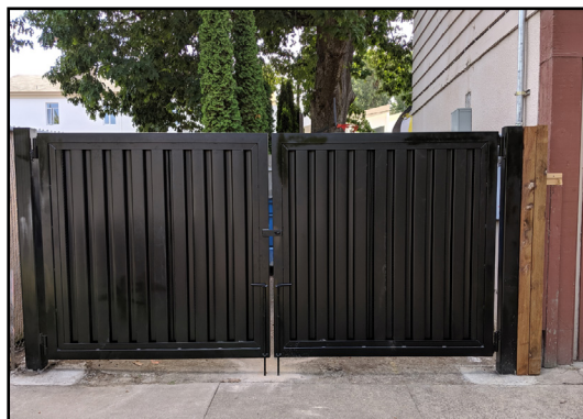
New gate for dumpster area and back yard.