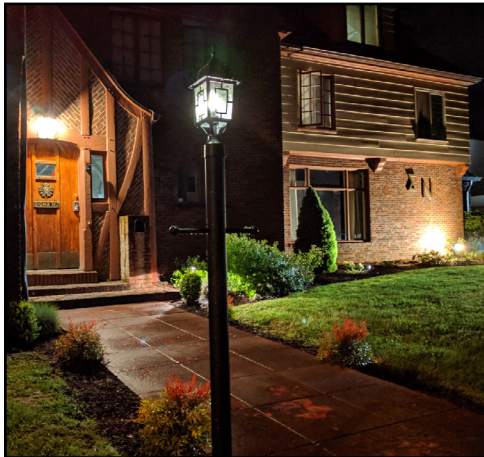
Some results of the lighting project.