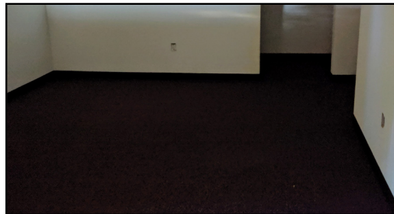
New carpeting in Room 10.